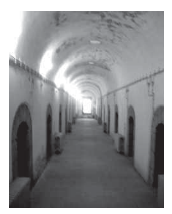
Figure 3 (at left): The hallway between the patients' rooms was illuminated by holes in the ceiling; electric lights are turned on when visitors arrive to tour the museum. Gevher Nesibe's will directed that patients would not have to pay for treatments given at the hospital, as was the custom in many of the hospitals built by the Caliphs.

Of special interest in the museum is the large anesthesia induction room next to the small operating room (see Fig. 4 on next page). They presumably did not use the term "anesthesia induction" but rather something like "soporific induction." The idea for this room seems obvious when one considers the slow-onset drugs that were used during this preparatory period before the operation was begun. The anesthetic potion described by the Greek physician Dioscorides (40–90 C.E.) in the first century consisted of Mandragora (mandrake) and wine, but Avicenna and others improved the formula. By the 13th century it consisted of multiple ingredients, including opium, Mandragora , Hyoscyamus , mulberry juice, lettuce seeds, Lapathum seeds, and climbing ivy. The drugs were administered orally, by inhalation, or through the skin (ointments). The History of Pharmacy and Medicine Preparation Room is conveniently located next to the induction room.